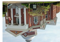
Manly Memorial Baptist Church

202 South Main Street Lexington, VA 24450 www.manlybaptist.com (540) 463-4181