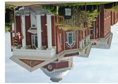
Manly Memorial Baptist Church

202 South Main Street Lexington, VA 24450 www.manlybaptist.com (540) 463-4181